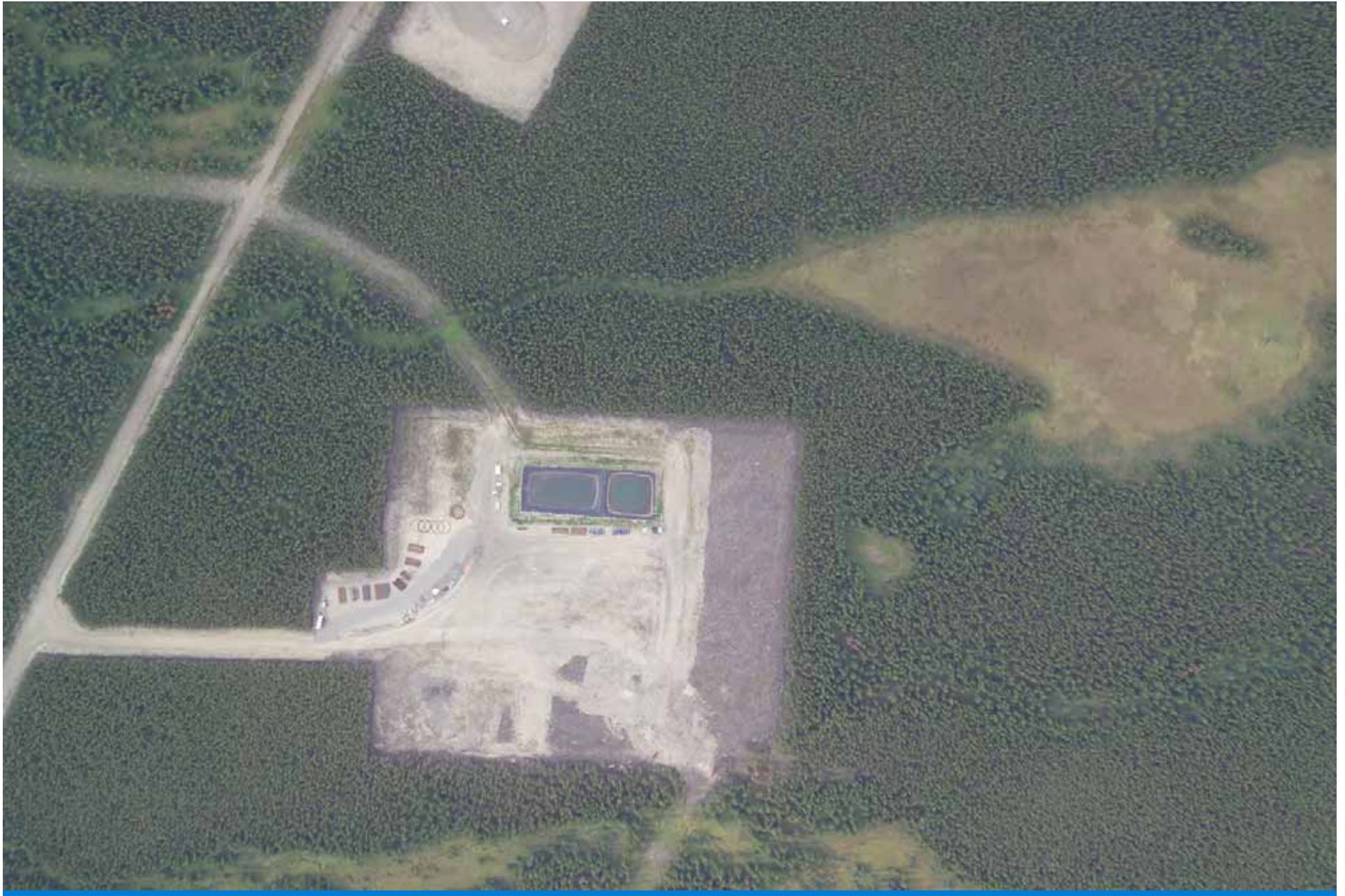
Aerial view of EnCana wellsite near Fernie