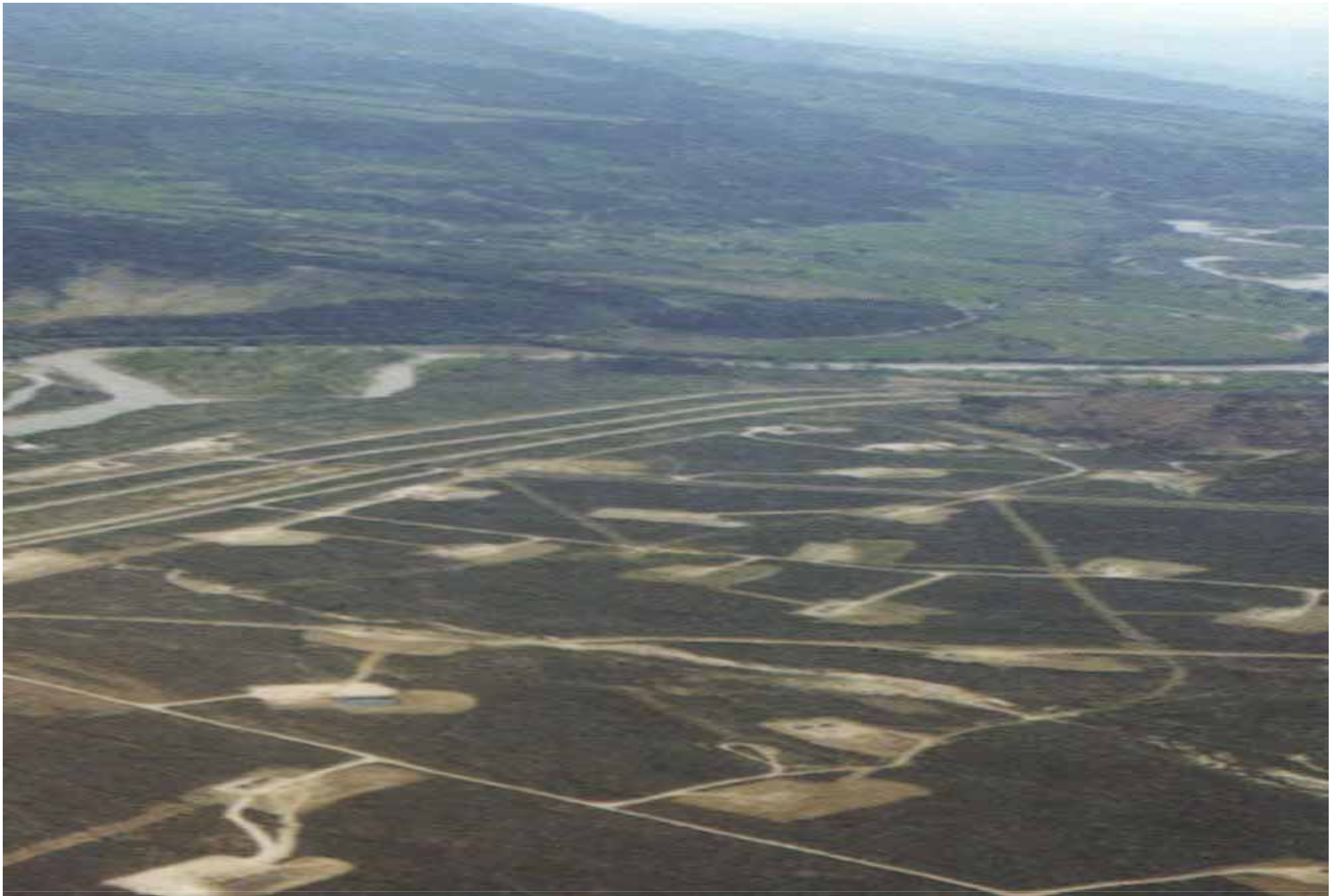
Coalbed methane wells in Colorado